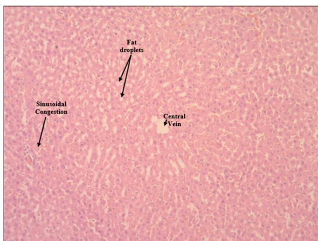
Fig. 2: Microscopic structure of liver tissue of obese rats