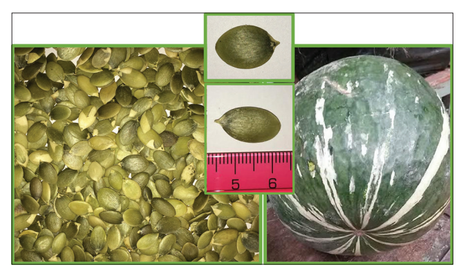
Fig. 1: Sambo seeds pumpkin without toast

\mathsf{FAMEs}:\mathsf{Fatty} acid methyl esters. GC/MSD: Gas chromatography/mass selective detector