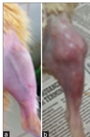
Fig. 1: The effects of monosodium iodoacetate on knee joint of the rat. (a) untreated rat, (b) treated rat

We then treated monosodium iodoacetate-treated rat by the extract of Pearl grass for 21 days, after 28 days induction, and edema measurements performed on day 0 before induction, day 7 th , 14 th , 21 th , 28 th , 36 th , 43 th , and 50 th . The positive control was used in this experiment is a combination of glucosamine and chondroitin sulfate. We choose of glucosamine to stimulate proteoglycan synthesis and inhibiting the degradation of proteoglycans, as well as stimulate cartilage regeneration after damage [16]. While chondroitin sulfate has a role in creating osmotic pressure sufficient to expand the matrix and collagen network [17]. Average edema volume of each group at day 7 th , 14 th , 21 th , 28 th , 36 th , 43 th , and 50 th can be seen in Fig. 2. Fig. 2 showed that an increase in the volume of edema in all groups except normal control on day 0 to day 28. On the negative control group was increased edema volume at day 36 but on days 43 and 50 a decline in the volume of edema, which is 3.7, 4.08, 4.43, 4.55, 4.93, 5.5, 5.25, and 4.8 \mu L. On the dose 1 group showed the decreased of average volume of edema at day 36, then, there is no change in the average volume of edema at day 43 and dropped back on the 50 th . Meanwhile, the dose 2 group showed the average of edema volume was decreased on day 36, then there is no change in the average volume of edema at day 43, then rose again on day 50. Dose 3 group showed an average of reduction of edema volume