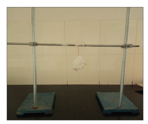
Fig. 2: Tail suspension test apparatus