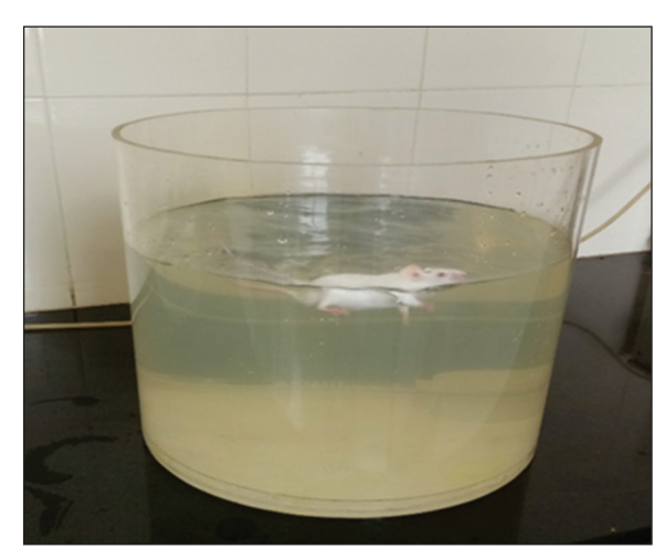
Fig. 1: Forced swimming test apparatus

Mean and standard deviation were used for continuous variables. Comparison of all the three groups (intragroup) for each experimental