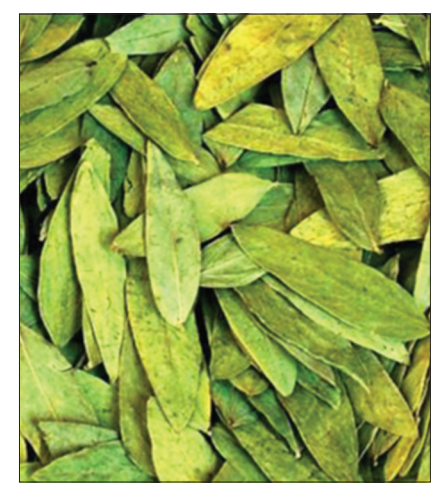
Fig. 2: Leaves of senna