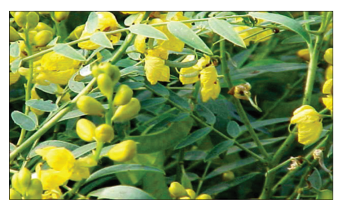
Fig. 1: Flowers and leaves of Cassia angustifolia

The dried leaves were powdered and extracted with petroleum ether, chloroform, ethanol, and water in soxhlet apparatus. The percentage yield was analyzed. The phytochemical tests were performed for the estimation of alkaloids, glycosides, flavonoids, and tannins in various plant extracts and resulted in the presence of carbohydrates, gums, proteins, alkaloid, saponins, flavonoids, and tannins and results are given in Table 1.