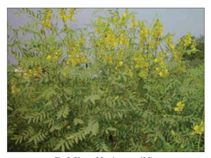
Fig. 3: Plant of Cassia angustifolia Geographical source: Senna is mostly found in Tirunelveli, Madurai, and Ramnathpuram districts of Tamil Nadu. It is cultivated in Kadapa District of Andhra Pradesh, Rajasthan, and Gujarat State [5].

Preliminary phytochemical and physicochemical investigations of C. angustifolia were performed in this study. These parameters are necessary for the identification of drugs and investigation of the bioactive constituents in medicinal herbs [13]. The presence of various chemical constituents in C. angustifolia may be a potential cause of treatment of various disorders. The quality of the plant can be estimated by determining the physical parameters. These investigations are of