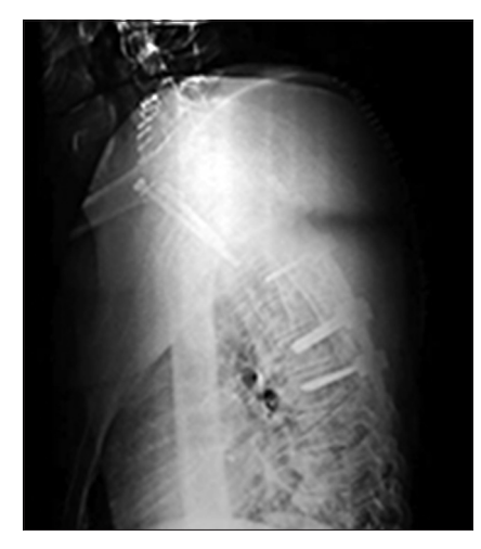
Fig. 6: The post-operative lateral radiograph where the dislocation is reduced with posterior spinal implants in-situ and also proximal humerus implants seen

stage posterior stabilization and in situ fusion of the fractured level was sufficient, and there was no progression of kyphosis. However, if there is progression of kyphosis during follow up the patient will require an anterior surgery with the corpectomy for the column to be reconstructed. In an article by Obeid et al. [11] three cases of fracture dislocation with complete transection of spinal cord in the dorsal spine were reported, where complete vertebrectomy and spine shortening was done. Post-operatively satisfactory coronal and sagittal plane alignment was achieved, as reported by the author. However, there is