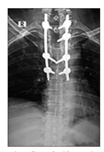
Fig. 5: Post-operative radiograph with posterior spinal implants in situ