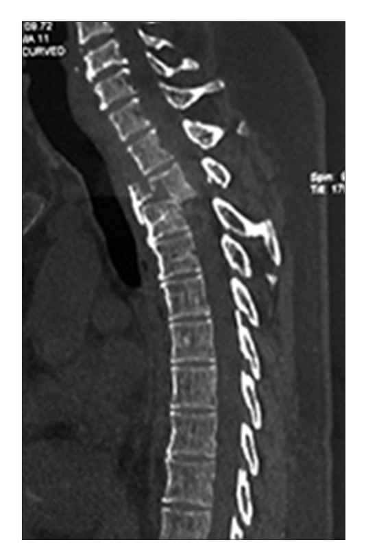
Fig. 1: Computed tomography image with fracture dislocation of D2 vertebra over D3 vertebra