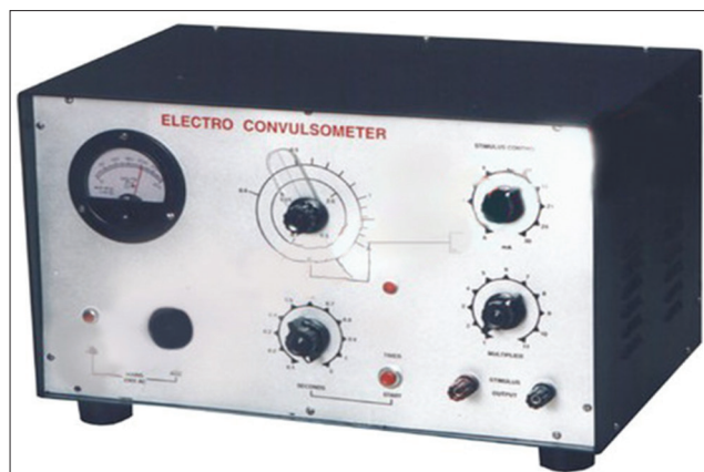
Fig. 1: Electroconvulsimeter