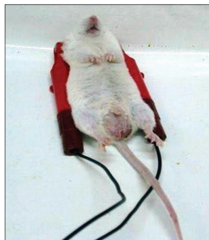
Fig. 2: Tonic hind limb extension