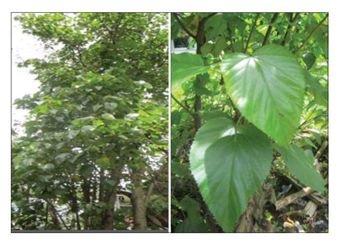
Fig. 1: Plant Melochia umbellata (Houtt) Stapf var. degbrata K