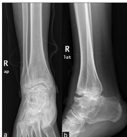
Fig. 1: (a) Anteroposterior and (b) lateral views of the right ankle during presentation in the clinic