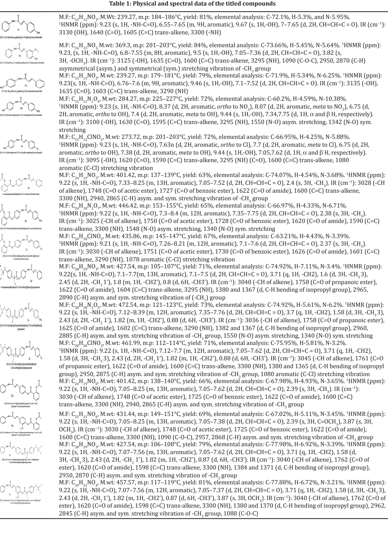
Table 1: Physical and spectral data of the titled compounds