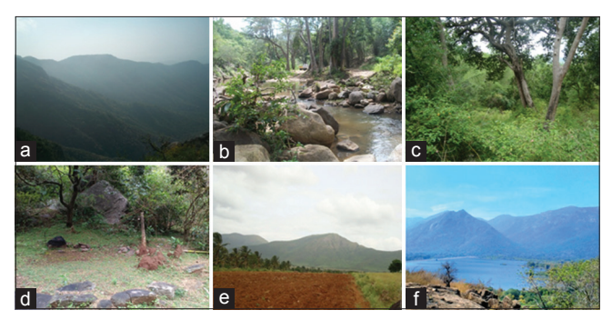
Plate 1: (a) Panoramic view of Eratti hill, (b) A stream of Eratti forest. (c) A dense forest. (d) Unbuilt Sivan temple in forest.(e) Cultivation land of tribals. (f) Varattupallam dam at the foothill