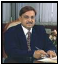
Patron AERB National Seminar,2019