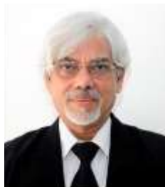
Patron AERB National Seminar,2019