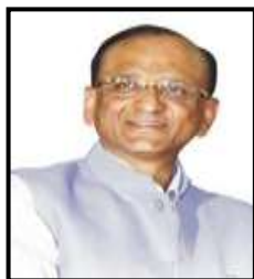
Chief Patron AERB National Seminar, 2019