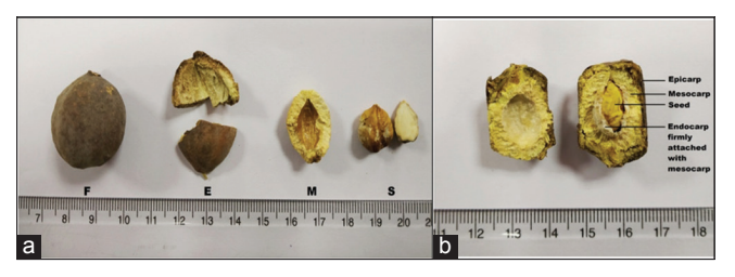
Fig. 1: (a) Whole fruit (F) with segregated parts (E: Epicarp, M: Mesocarp+endocarp, S: Seed); (b) Longitudinal section of fruit showing layers

An amount of 100 g authenticated fruits was crushed to obtain coarse powder, keptin an airtight glass jar, and labeled as F (indicating whole fruit).