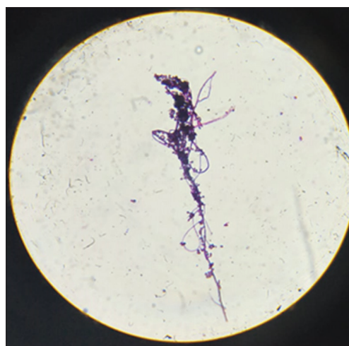
Fig. 1: Microscopic view of DDE6 isolate (spore arrangement)