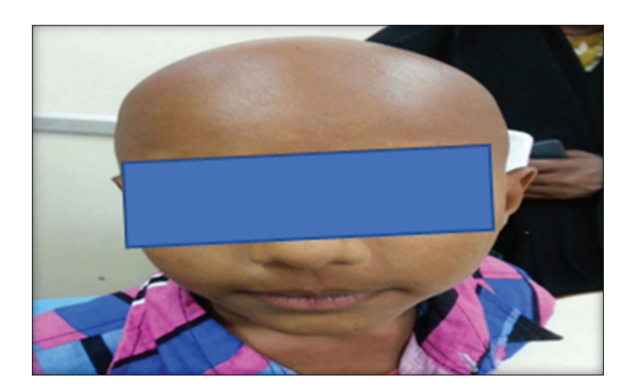
Fig. 13: Aplasia cutis congenita

Fungal infections (5%) revealed fourth high frequency in our study. Fungal infections were reported to be high (15.8%) in Nigeria study conducted in children by Ogunbiyi et al. [22] and reported high (18.8%) in the study conducted by Kelbore et al. [23] in Southern Ethiopia. The reason for such imbalance between various reports may be due to the variation in fungal species prevalence in different areas. Tinea corporis, tinea capitis, and tinea versicolor were in top list among the group of fungal infections. In our study, tinea versicolor is most prevalent, this is compared with the study conducted by Ravindra et al. [24] which showed that tinea versicolor is the most common. On the other hand, next most prevalent fungal infection is tinea capitis. This shows similarity with Iraq studies conducted by Fathi and Al-Samarai [25] and Palestine studies conducted by Ali-Shtayeh et al. [26]. A study in Pakistan [27] reveals that fungal infections were the most common (20.6%).