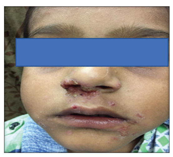
Fig. 2: Impetigo