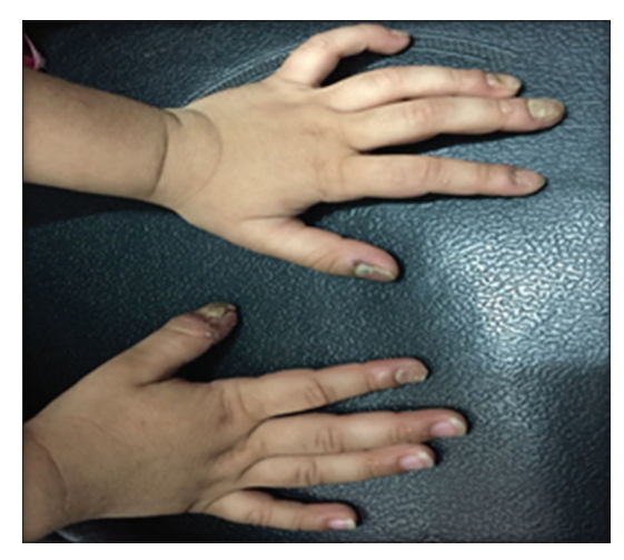
Fig. 12: Tinea unguium

Bacterial skin infection (23.4%) is the second most frequent and prevalent infectious skin disease. Egyptian study on prevalence of skin diseases among infants and children conducted by Mostafa et al. [15] shows similar results. In bacterial infections, impetigo was the most prevalent representing (9.5%) of all cases. On the other hand, high frequency of impetigo (49.4%) observed in a study which was conducted by Yeoh et al. [19]. In our results, the highest frequency of bacterial infection can be due to the hot humid climate, overcrowding, and low socioeconomic factors.