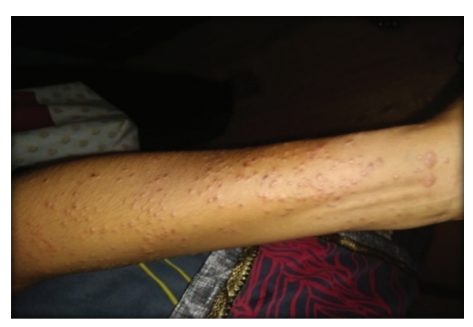
Fig. 7: Contact dermatitis