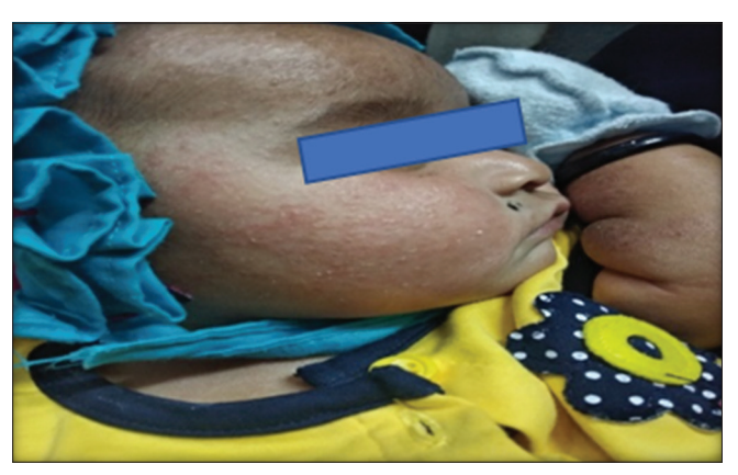
Fig. 4: Atopic dermatitis