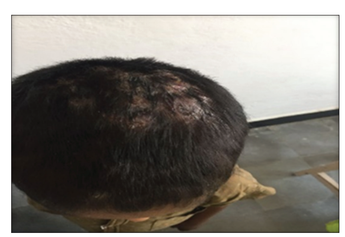
Fig. 11: Tinea capitis