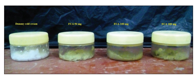
Fig. 1: Cold cream prepared using methanolic extract Caralluma adscendens var. attenuata (MECA) for three concentration 50 mg, 100 mg, and 200 mg. The dummy creams were made all ingredients and except herbal extract of MECA

According to previous reports, various solvent succulents demonstrated antimicrobial activity against different microorganism [14]. Antimicrobial activity of cold cream containing biofabrication of MECA crude, on the other hand, negative control cold cream containing without extract of MECA and Neosporin, is used as the positive control. The antimicrobial activity of zone inhibition on the bacterial and fungal strain has significantly increased by Neosporin (market available cream) and formulated cold creams.