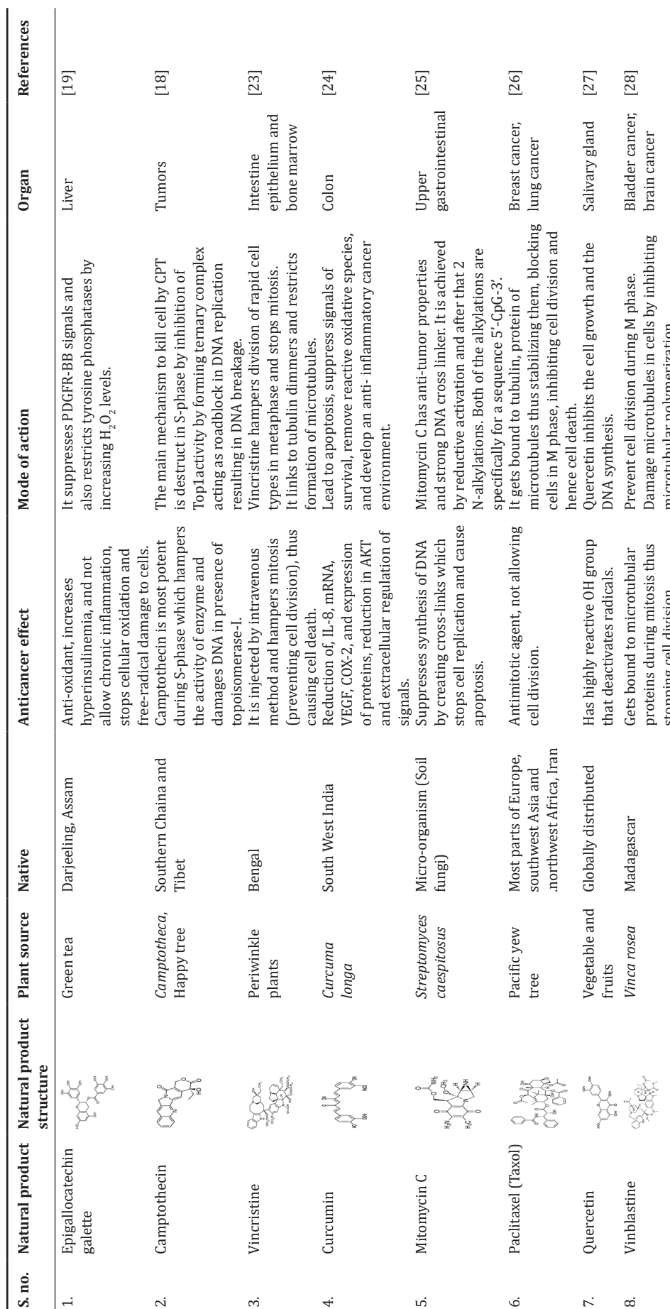
Table 1: List of natural compound anticancer product (anticancer activity) and mode of action