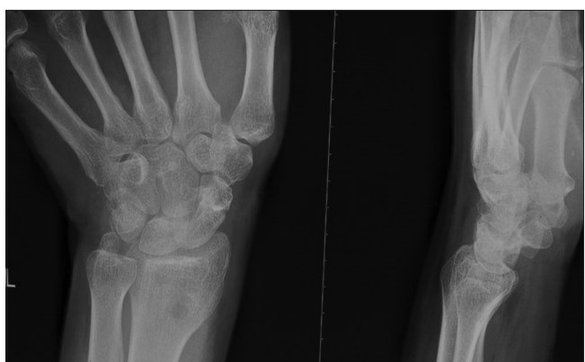
Fig. 4: Radiograph at 12 weeks post-operative showing bony union

arthritis. Previous studies have stressed much upon the necessities of overtreatment of missed scaphoid fractures, proactive fixation of nondisplaced fractures, early but anatomic reduction and stable fixation of unstable fractures, but very little is discussed about the role and results of bone grafting in such situations. Keeping in mind the higher incidence of scaphoid fracture and its complications compounded with its impact on social economy in terms of time off from work and lost productivity, it is needed to explore some adjuvant modality to fasten the bone healing and thereby decreasing the economic burden. On extensive search of literature, we found that the operation method used has not been described at length till now.