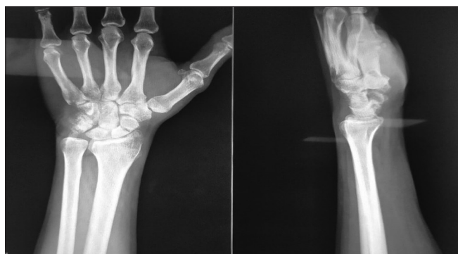
Fig. 2: Pre-operative radiograph of Fracture Scaphoid Herbert type B