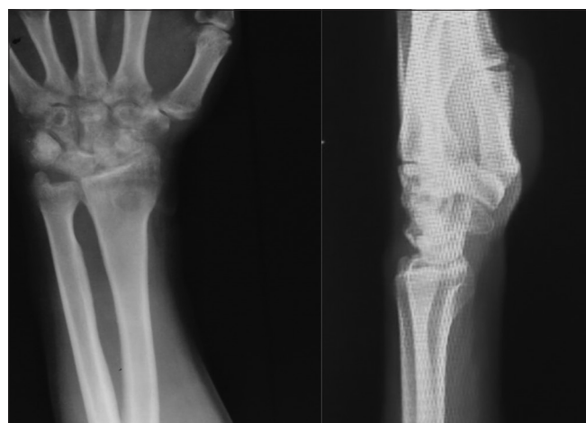
Fig. 3: Radiograph at 6 weeks post-operative after K wire removal showing unition fracture