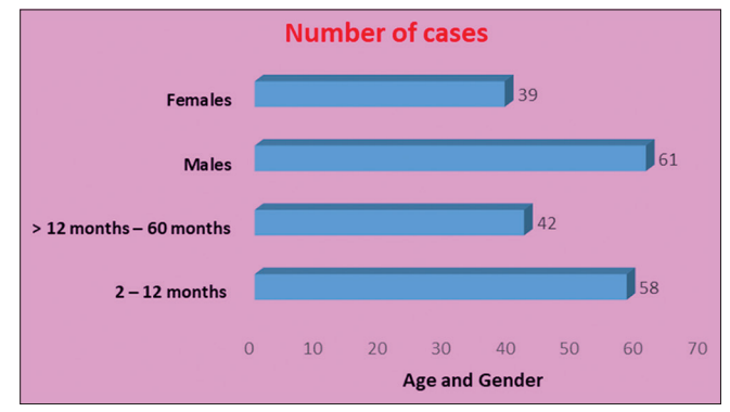
Fig. 1: Age and gender-wise distribution of cases