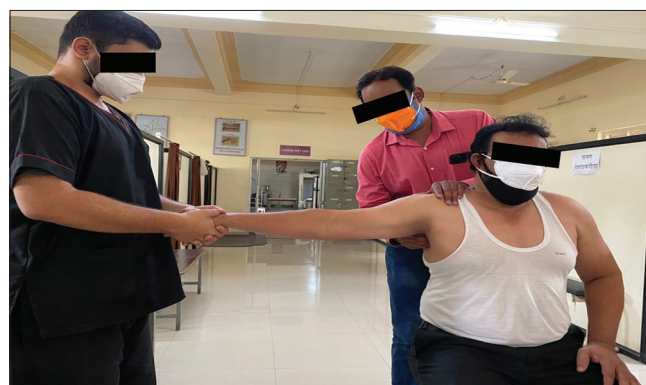
Fig. 3: Axial release of subscapularis muscle

mobilization group had 15 participants with mean age of 50.26 \pm 6.01 years and body mass index (BMI) mean was 25.91 \pm 2.79 kg/m 2 . Conventional physiotherapy and Maitland mobilization group also had 15 participants with mean age of 51.33 \pm 5.32 years and BMI mean was 25.91 \pm 2.79 kg/m 2 . The mean difference of all data was statistically not significant ( p > 0.05 ). Baseline demographic and clinical data was comparable (Table 1).