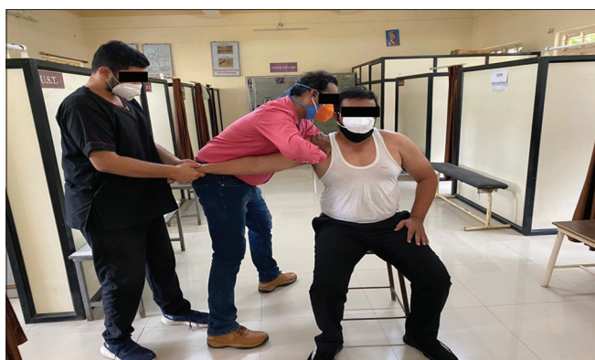
Fig. 2: Sustained mobilization with traction