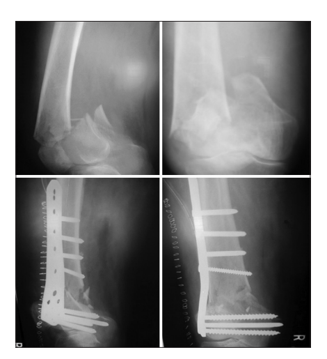
Fig. 1: Pre-operative X-ray showing extra-articular right side distal femur fracture AO type A2 (Upper left and right) and postoperative X-rays showing surgical treatment by plates (Lower left and right)

We have classified proximal tibia fractures according to A0 classification. Most common fracture were A3 type and C2 type both were 7 in numbers each, contributing to total of 70% of all proximal tibia fractures. A2 type were 3 (15%) in numbers, followed by B3, C1, C3 each one in number. One proximal tibia fracture A0 type B1, associated with distal femur fracture, was treated with cannulated cancellous screw, not included in our study. Our results are comparable with Ha et al. [11]. In study by Christian Boldin et al. [12], 10 fractures were extra-articular and 16 were intra-articular. Similarly, we have used A0 classification for distal femur fractures. Both intra and extra-articular fractures were equal in number. Most common type was C3; six in number contribute to 30% of cases, followed by C2 and A3 20% each and A1 and A2 15% each. Our incidence is similar to study by