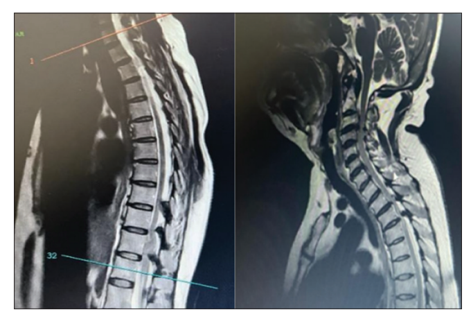
Fig. 2: T2-weighted sagittal magnetic resonance imaging of the patient, dorsal canal stenosis due to ligamentum flavum hypertrophy with cord compression at dorsal levels from 9 to 11 (left) cervical canal stenosis from cervical level C3–C7 with severe cord compression (right)