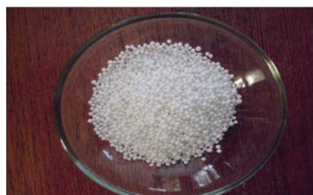
Fig. 2: Sodium alginate/ferrous sulfate (1:1) microcapsules, Formula XI was stored at room temperature. After 30 d there was no change in color, content and particle size ( 209 \mu\text{m} \pm 2.5 )

were conducted in triplicate and the mean. Values were plotted versus time with a standard deviation ( p < 0.05 ).