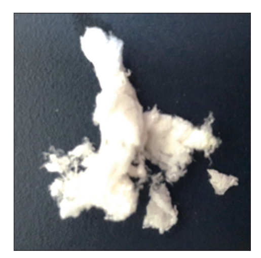
Fig. 1. Organoleptic isolated bovine collagen

The pH of the collagen samples was 6.64. The collagen pH value in this study was in accordance with the collagen standard established by BSN (2014), which states that the standard pH value of collagen ranges from 6.5 to 8. The neutral pH of the collagen samples obtained is due to the effect of neutralization with aquadest after dialysis using acetic acid [7].