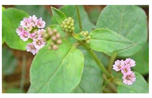
Fig. 1: Boerhavia diffusa

used as an appetiser [5]. Boerhavia diffusa Linn. Stimulates the liver and alleviates viral jaundice. This herb possesses diuretic, antiinflammatory, and anti-arthritic qualities, and it also has spasmodic and antimicrobial characteristics. As a painkiller, laxative, diuretic, and abortifacient in the treatment of conjunctivitis, the roots of the plant have long been employed [6]. It is supposed to aid in the improvement and protection of vision. The plant is diuretic in nature and is utilised by diabetics to help them control their blood glucose levels. The root has been used as a diuretic in the treatment of jaundice, an enlarged spleen, gonorrhoea, as well as other inner inflammations. Aside from being an expectorant, it is also used as an expectorant, anthelmintic, cardiotonic, hepatoprotective, and anthelmintic. A paste of the roots is applied directly to the skin to treat abscesses and ulcers. [7]. Fig. 1 shows the Boerhavia diffusa