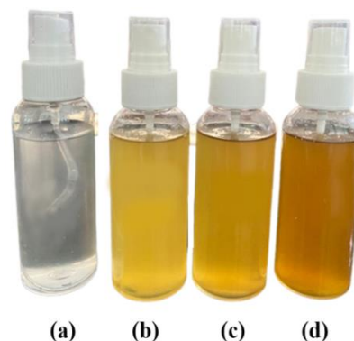
Fig. 1: Spray gel of CarSG (a), GM-CarSG 1 (b), GM-CarSG 2 (c), and GM-CarSG 3 (d)

light color and becomes dark color depending on the concentration of extract in the preparation [25, 26]