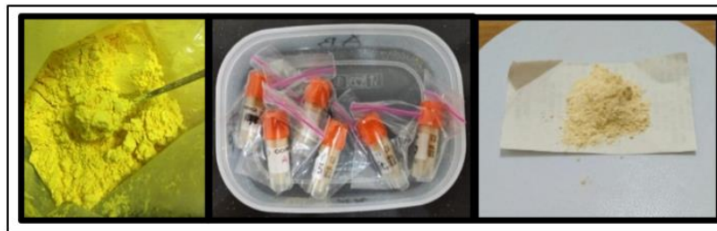
Fig. 1: Tetracycline raw material was obtained from Hubei ChenXun Co., Ltd. (left), FD-PRP was obtained from the biotechnology laboratory, Faculty of Dentistry Universitas Gadjah Mada (middle) and chitosan was obtained from Integrated Laboratory, Faculty of Pharmacy Universitas Sumatera Utara (right)

Chitosan-based 0.5% tetracycline gel is made with a composition consisting of 2 grams of chitosan, 0.5 grams of tetracycline and 1 % lactic acid. All tools used were sterilized in the oven at 170 oC for 1 hour. The manufacturing process is carried out aseptically in a laminar airflow cabinet. A total of 2 grams of chitosan was put into the stamper, added with 1% lactic acid solution which had been diluted to 50 ml and stirred slowly until it formed a 4% chitosan hydrogel. Then, 0.5 gram of tetracycline was added and stirred slowly until homogenous and chitosan-based tetracycline gel 0.5% was formed [16]. In the second preparation, 1.5 grams of FD-PRP was added and stirred slowly until homogeneous and chitosan-based FD-PRP gel was formed [22]. In the third preparation, 0.5 gram tetracycline and 1.5 gram FD-PRP were added and stirred slowly until homogeneous and a combination of chitosan-based 0.5% tetracycline gel and FD-PRP was formed (fig. 1).