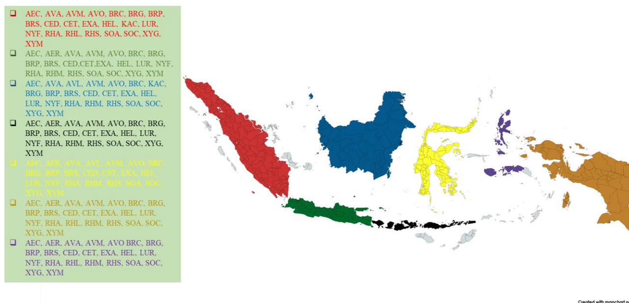
Fig. 1: Distribution patterns of mangrove species in Indonesia. The abbreviation of each species corresponds to its common name as follow: Aegiceras corniculatum (AEC), Aegialitis rotundifolia (AER), Avicennia alba (AVA), Avicennia lanata (AVL), Avicennia marina (AVM), Avicennia officinalis (AVO), Bruguiera cylindrical (BRC), Bruguiera gymnorrhiza (BRG), Bruguiera parviflora (BRP), Bruguiera sexangula (BRS), Ceriops decandra (CED), Ceriops tagal (CET), Excoecaria agallocha (EXA), Heritiera littoralis (HEL), Kandelia candel (KAC), Lumnitzera racemose (LUR), Nypa fruticans (NYF), Rhizophora apiculata (RHA), Rhizophora lamarckii (RHL), Rhizophora mucronata (RHM), Rhizophora stylosa (RHS), Sonneratia alba (SOA), Sonneratia caseolaris (SOC), Xylocarpus granatum (XYG), and Xylocarpus moluccensis (XYM)

The analysis of mangrove species distribution in Indonesia reveals the presence of 25 distinct mangrove species across the archipelago, with almost all species spanning across various provinces. Several species exhibit restricted distributions, such as Aegialitis rotundifolia , found exclusively in Java, Bali, Sulawesi, Maluku, and Papua; Avicennia lanata in Kalimantan and Sulawesi; Kandelia candel in Sumatra and Kalimantan; and Rhizophora lamarckii in Sumatra, Maluku, and Papua. The comprehensive distribution map, illustrated in fig. 1, provides an overview of the widespread occurrence of mangrove species throughout Indonesia, emphasizing both their ubiquity and specific regional constraints.