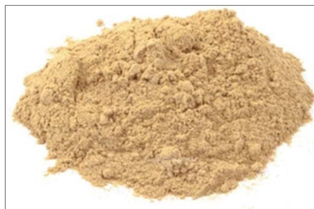
Fig. 5: Powder