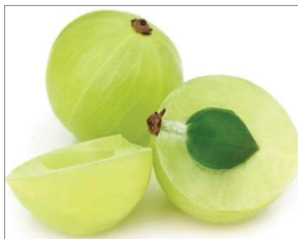
Fig. 3: Fresh fruit