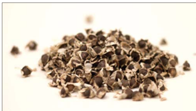
Fig. 7: Seeds

EO (amla) has been called the first-rate of the ayurvedic rejuvenating herb, considering by way of the usual stability of tastes (sweet, sour, pungent, bitter, and astringent) multifunction fruit and is well identified for its dietary characteristics. EO (amla) fruit is regularly the richest recognized normal source of vitamin C (200-900 mg per a hundred g of safe to eat component). The fruit juice involves close to 30 instances as so much nutrition C as orange juice, and a single fruit is the same as antiscorbutic value to at least one or two oranges. It also involves