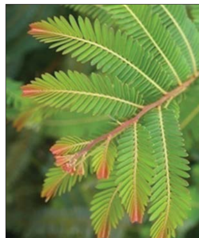
Fig. 6: Leaves