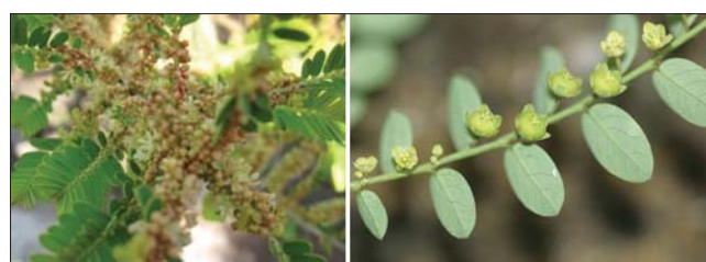
Fig. 2: Flowers