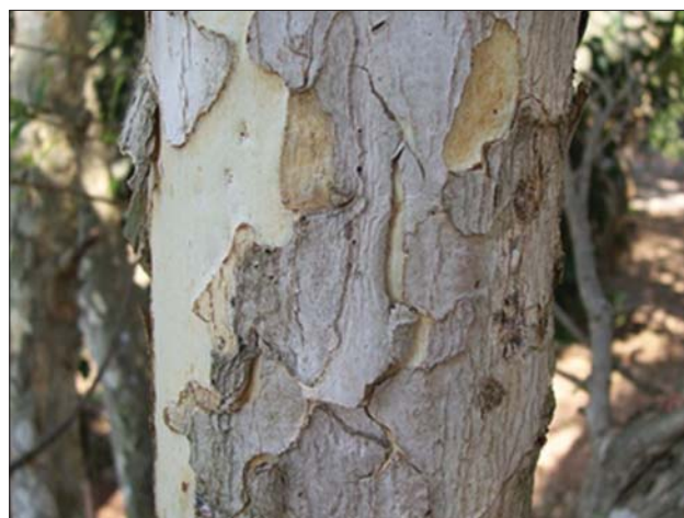
Fig. 1: Bark

It consists of fresh fruit pulp of EO (amla): (a) Macroscopic, (b) microscopic, (c) identity, purity, and strength, and (d) dose (Fig. 3) [14].