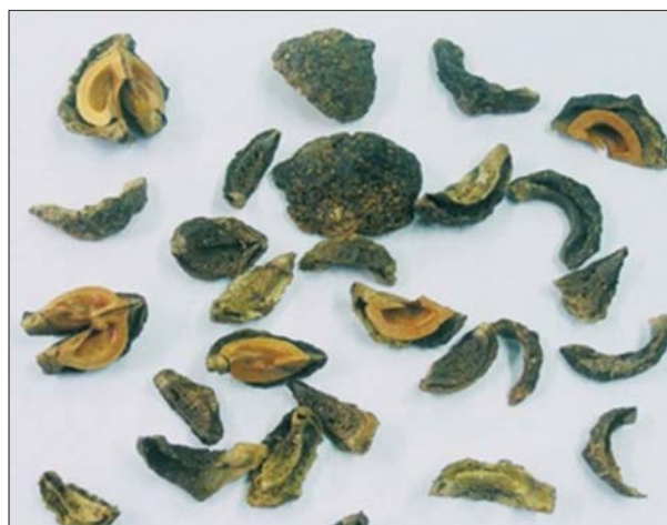
Fig. 4: Dried fruit

Obovate-triangular, 3 celled, seeds 2 in each cell (Fig. 7) [13].