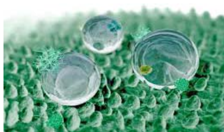
Nano hydrogel that attack cancer cell

For example, sodium alginate hydrogels are formed physically by cross-linking due to addition of calcium ions but are unstable and disintegrate rapidly and Unpredictably. (12-20).