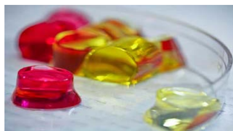
Self healing hydrogel