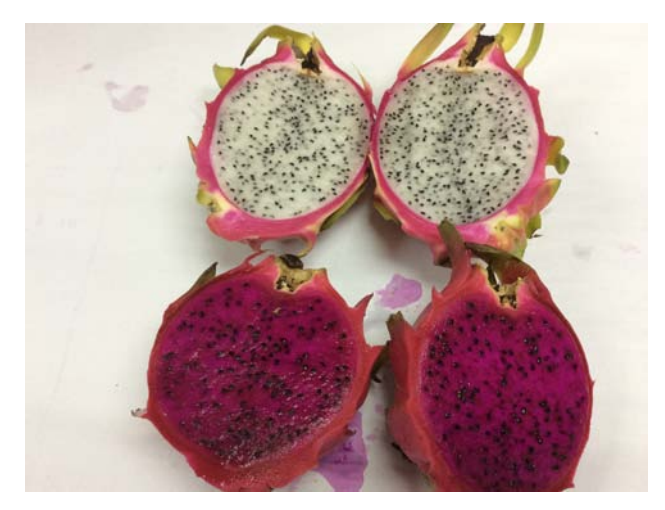
Fig. 1: Hylocereus undatus (white dragon fruit) and Hylocereus polyrhizus (red dragon fruit).

To 200 \mu l of DPPH solution, 10 \mu l of each of the extract or standard solution was added separately in wells of the microtitre plate. The plates were incubated at 37 °C for 30 min and the absorbance of each solution was measured at 490 nm (Hwang et al. , 2001), using UV-VIS spectrophotometer. The concentration which is showed 50% inhibition (IC<sub>50</sub>) will be calculated.