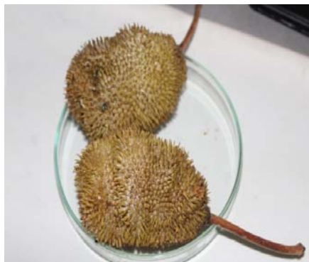
Fig. 1: Mature fruits of Artocarpus hirsutus

The Artocarpus hirsutus fruit locally called Anjili Chakka belongs to the Moraceae family. Aini (Anjili) is a tall evergreen tree, generally 20-25 m in height and up to 5 m in girth, fruits are edible, bright yellow (Fig.1-2), ovoid or globose covered with spines, seeds ovoid and white. Artocarpus hirsutus is an endemic tree species of the southern Western Ghats of peninsular India and Maharashtra Sahyadris [4].