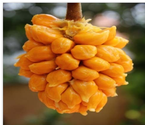
Fig. 2: Ripened fruit without pericarp

Natural products from plants called secondary metabolites are the end products of primary metabolites such as carbohydrates, amino acid, chlorophyll, lipids and so on. They are synthesis a large variety of chemical substances known as secondary metabolites which include alkaloids, steroids, flavonoids, terpenoids, glycoside, saponin, tannins, and phenolic compounds. The secondary metabolites are very good antioxidant compounds. The richness of phytochemical bioactive compounds possess antioxidant, antitumor, antimutagenic, anticarcinogenic, and antiparasitic activities [5].