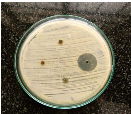
Fig. 2: Antibacterial susceptibility testing of Prosopis juliflora against aerobic bacteria