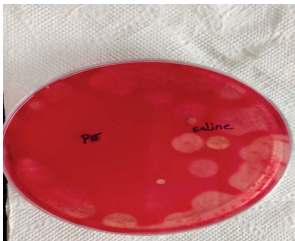
Fig. 3: Antibacterial effectiveness of Prosopis juliflora against anaerobic bacteria