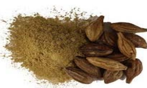
Fig. 7: Haritaki fruit