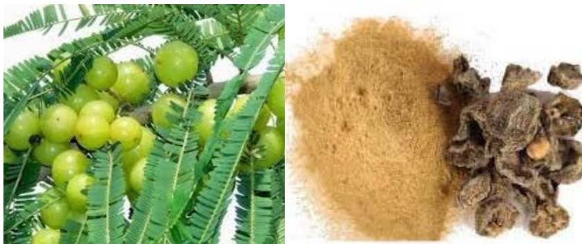
Fig. 9: Amlaki

Make Triphala tea in distilled water using 1 tsp of powdered water in 200 ml. Strain the liquid when it is cold, using a cotton swab. Apply this cold solution in a face wash for both sides for 5-7 min. The astringent effect of Triphala berries causes a burning sensation but only at the beginning. Once the eyes are accustomed to it, it feels cool and comfortable. This is good to do once in the evening, and it works (endless) dry eyes, red eyes, and irritated conjunctiva.