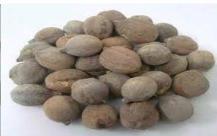
Fig. 8: Vibhitaki