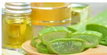
Fig. 5: Aloe vera

Strain the aloe vera meat into a cube large enough to hold your finger well and freeze separately. When the eyes feel tired, take one cube out of the fridge and rub the face and the area around the eyes at the same time every day preferably in the evening. When the cube is finished, keep your cold finger on the eyes to calm them down [38].