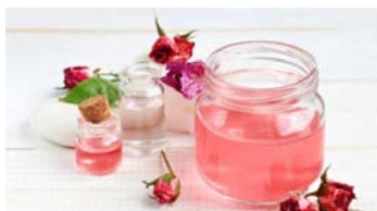
Fig. 6: Rose water