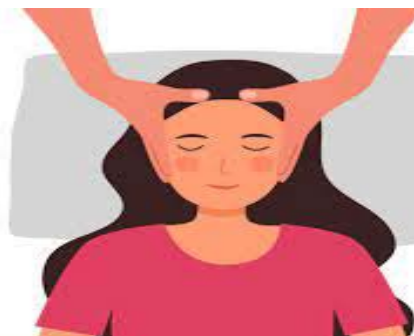
Fig. 3: Head massage

Regular head massage is good for improving circulation around the area and relaxing the muscles needed to maintain the ability to look and rejuvenate the tear glands. You can use coconut oil or any of its medicinal varieties.