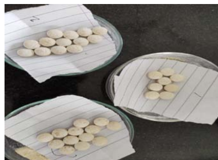
Fig. 3: Formulated tablets of different excipients ratios

The formulated tablets (fig. 2) were evaluated as per the Indian Pharmacopoeia, 2010.