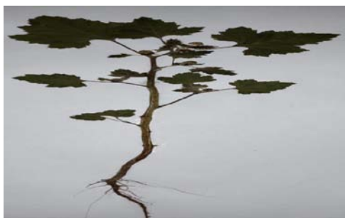
Fig. 1: Xanthium indicum J. Koenig ex Roxb