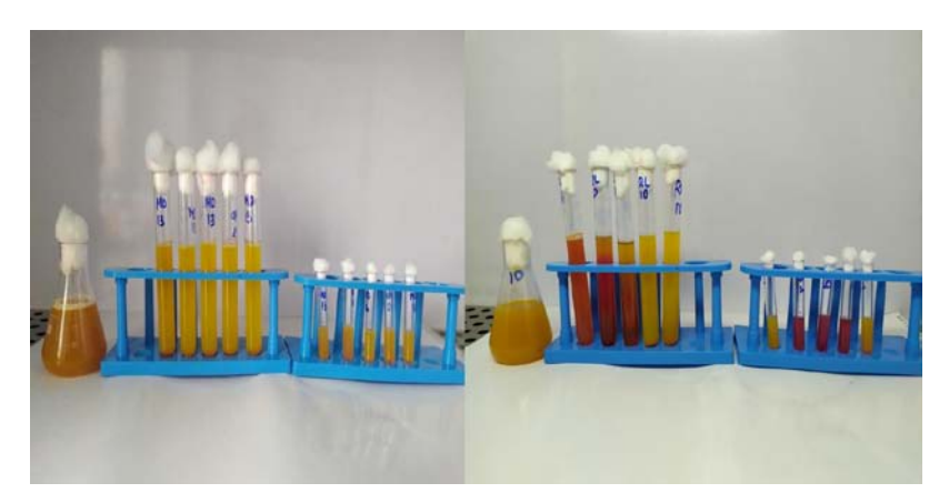
Fig. 1: MPN tubes showing changing of color due to fermentation of double strength MacConkey medium by pathogens