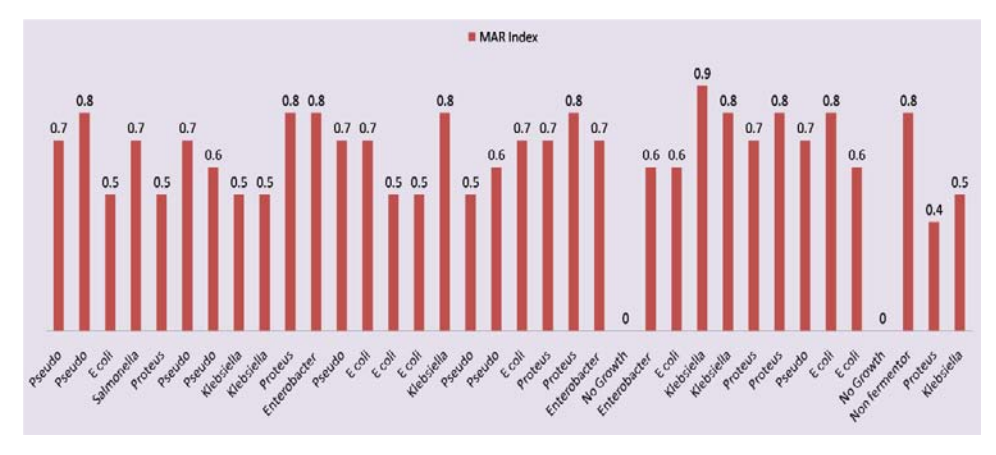
Fig. 5: MAR index of the isolated pathogens from bore water sources