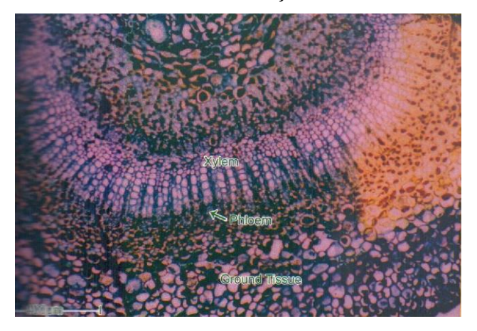
Figure 4: T.S Through the MIDRIB of P.guajava L. leaves - A portion enlarged- (BANGALORE)