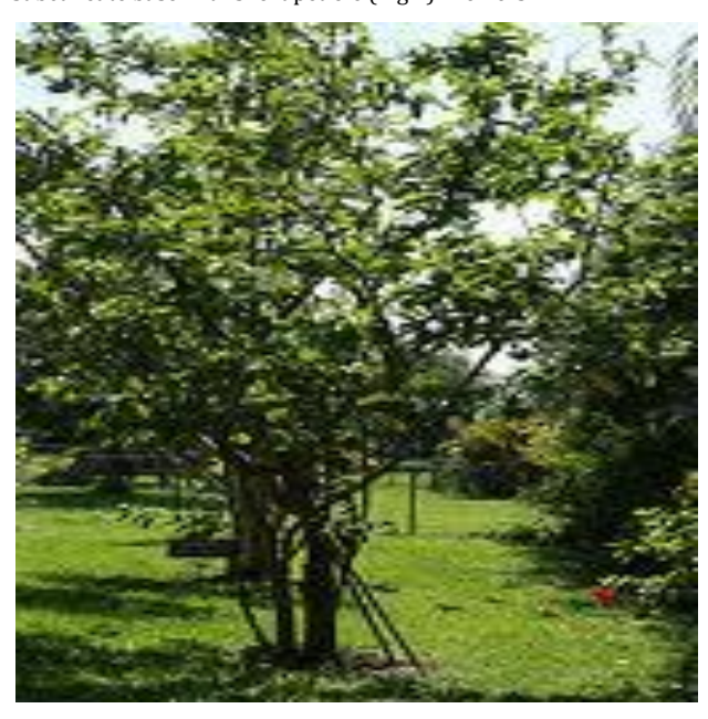
Figure 1: Habit of P.guajava L

Psidium guajava is a large dicotyledonous- shrub or small evergreen tree, generally 3-10m high with many branches and crooked stems (Fig 1). Leaves (5-8cm \times 4-5 cm) are opposite, simple, stipules absent, oblong – elliptic, dull grey to yellow green with entire margin, obtuse to bluntly acuminate apex and rounded to subcuneate base with short petiole (Fig 2). Flowers