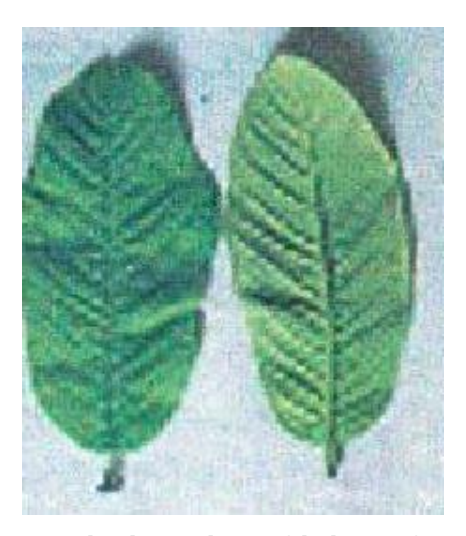
Figure 2: Dorsal and Ventral view of the leaves of P.guajava -Bangalore Variety