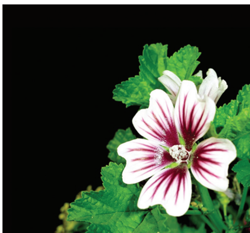
Fig. 1: Flower of Malva sylvestris L.