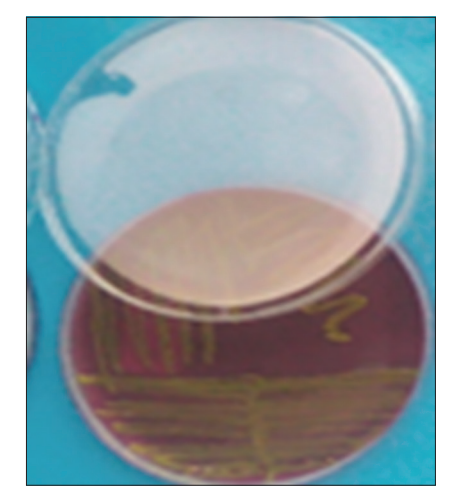
Fig. 1: Escherichia coli colonies on EMB agar

The colonies were suspended in 0.85% saline, and the turbidity was compared with the 0.5 McFarland standard (equal to 1.5 \times 10^8 colony-forming units/ml). The suspension was loaded on a sterile cotton swab