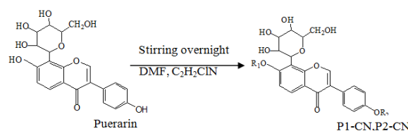
Scheme 1: Synthesis route of puerarin derivatives, R 1 ,R 2 :C 2 H 2 N,C 2 H 2 N (P 1 -CN);C 2 H 2 N,H (P 2 -CN)

In this study, puerarin derivatives were designed by adding an active acetonitrile group that inhibits COX-2 in order to enhance its anti-vascular dementia drug activity. The acetonitrile group was linked to puerarin at the 7/4 'positions by a phenolic hydroxyl to give 7-mono-and 7, 4' di-substituted derivatives of puerarin. This process resulted in the synthesis of two compounds that were previously unreported. The route of synthesis is shown in Scheme 1. We evaluated the affinity of these two derivatives towards COX-2 as well as their anti-vascular dementia activities.