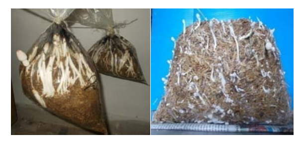
Fig. 3: Production of potent Mushroom (Pleurotus sajor-caju)

Cultivation of mushrooms showing maximum in-vitro antibacterial activity ( Pleurotus sajor-caju ) was done in the laboratory. Wheat grain along with calcium carbonate and Calcium Sulphate was used as substrate for preparing the spawn. The inoculated spawns were incubated at room temperature. Afterwards proper sterilization was done and excess water was confiscated from the wheat straw these were, then packed in the sterilized polythene bags and inoculated with the spwan of Pleurotus sajor-caju then incubated at 28±1°C in a dark place for 20 to 25 days.