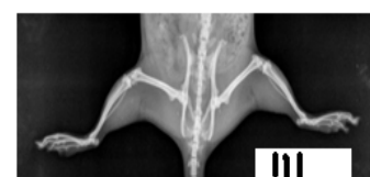
Sample- Methanol extract