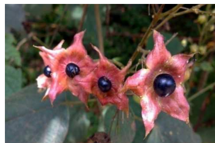
Fig. 2: Fruits of C. infortunatum Linn.

Flowers are bluish-purple often white in pyramid shaped terminal panicles. The plant is slightly woody shrub in nature with blunt quadrangular stems and branches, leaves are usually three at a node, sometimes opposite oblong or elliptic, serrate, flowers are blue, many in long cylindrical thyrsus and the fruits are four lobed purple durpe, somewhat succulent with one pyrene in each lobe [11]. The microscopic characters of the root involve stratified Cork, phelloderm, stone cell layer, cambium, large lignified vessels, xylem fibre etc [12].