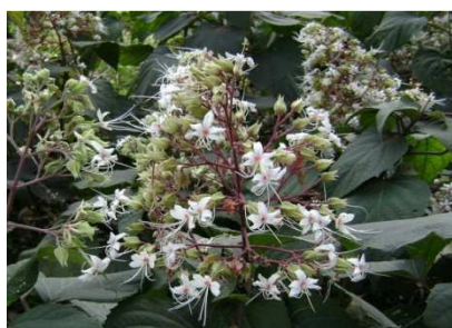
Fig. 1: Plant of C. Infortunatum Linn.

In the present study, C. infortunatum Linn. (Family-Verbenaceae, Bhat in Hindi, Ghentu in Bengali, Bhanja in Oriya) is selected to assess its ethno botanical importance due to randomly use as traditional medicine to cure common ailments such as in the treatment of bronchitis, asthma, fever, diseases of the blood, inflammation[1], burning sensation, tuberculosis, hepatoprotective [2]. And antiepileptic in Indian folk medicine [3, 4]. Traditionally, the plant leaves extract is given orally in fever and bowel troubles among the Kuki and Rongmai Naga tribes of North-East India. Also fresh leaf-juice is introduced in the rectum for removal of ascarides. Leaves and flowers are used to cure scorpion sting. Rabha, Rajbanshi, Polia and Lepcha tribes of North Bengal use fresh root-bark of bhat to cure diarrhoea. Kachari, Hmar and Riang tribes of Barak Valley and North- Cachar hills use leaf extract in stomach pain and in diabetes [5]. The root paste is also used as a bandage in swelling [6]. Fresh juice of the leaves has been used as vermifuge and in the treatment of malaria [7, 8].