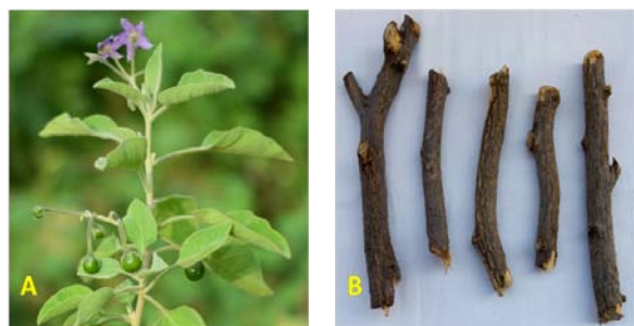
Fig. 1: A. Habit of S. pubescens , the source of leaf material, B. The stem with bark