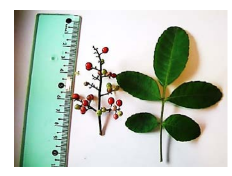
Fig. 1: The fruits, leaves and flower of the S. terebinthifolius Raddi