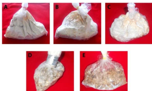
Fig. 3: Spawn growth on various grain substrates. A. Wheat, B. Pearl millet, C. Barley, D. Maize, E. Soybean

On comparing the previous work on other mushrooms, Potato Dextrose Agar and Yeast Malt Agar found the best medium for Ganoderma applanatum [16]. Malt extract medium was found best for radial growth of Lentinus cladopus [17].