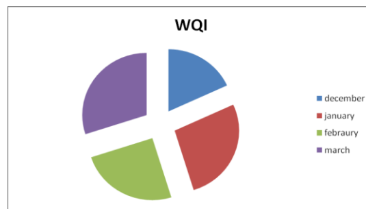
Fig.4: WQI in different seasons